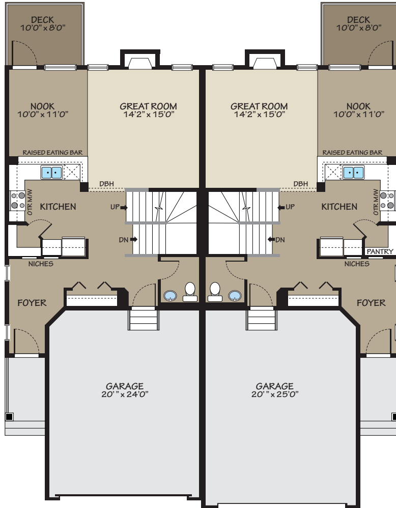
MAIN FLOOR 811 SQ. FT.